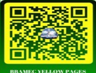
BBAMEC YELLOW PAGES REGISTRATION

If you have a business that You would like BBAMEC Members To know about, Please CLICK ON AND FILL OUT THIS FORM